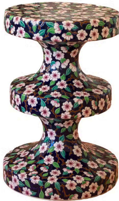
Apple Blossom Moonlight Bishop Stool (2024), by India Mahdavi and the Manufacture des émaux de Longwy. INDIA MAHDABI

In addition to these 18 stands, a collective space displays around twenty innovative pieces, favorites of the two curators. Among them, the sculptural Auguste light fixture, by Constance Guisset (which she created in homage to the architect Auguste Perret); the Ysa wall lamp with three overlapping sheets of striated, sandblasted, and smoked glass, by Tristan Auer for Veronese; and the Apple Blossom Moonlight Bishop stool, by India Mahdavi, with multicolored cloisonné enamel flowers from Longwy, by the eponymous manufacturer founded in 1798 in Lorraine.