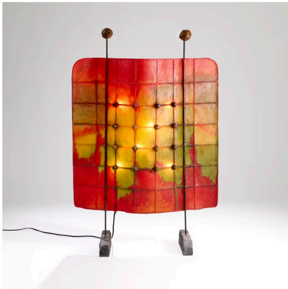
Square Lamp (1986), by Gaetano Pesce.