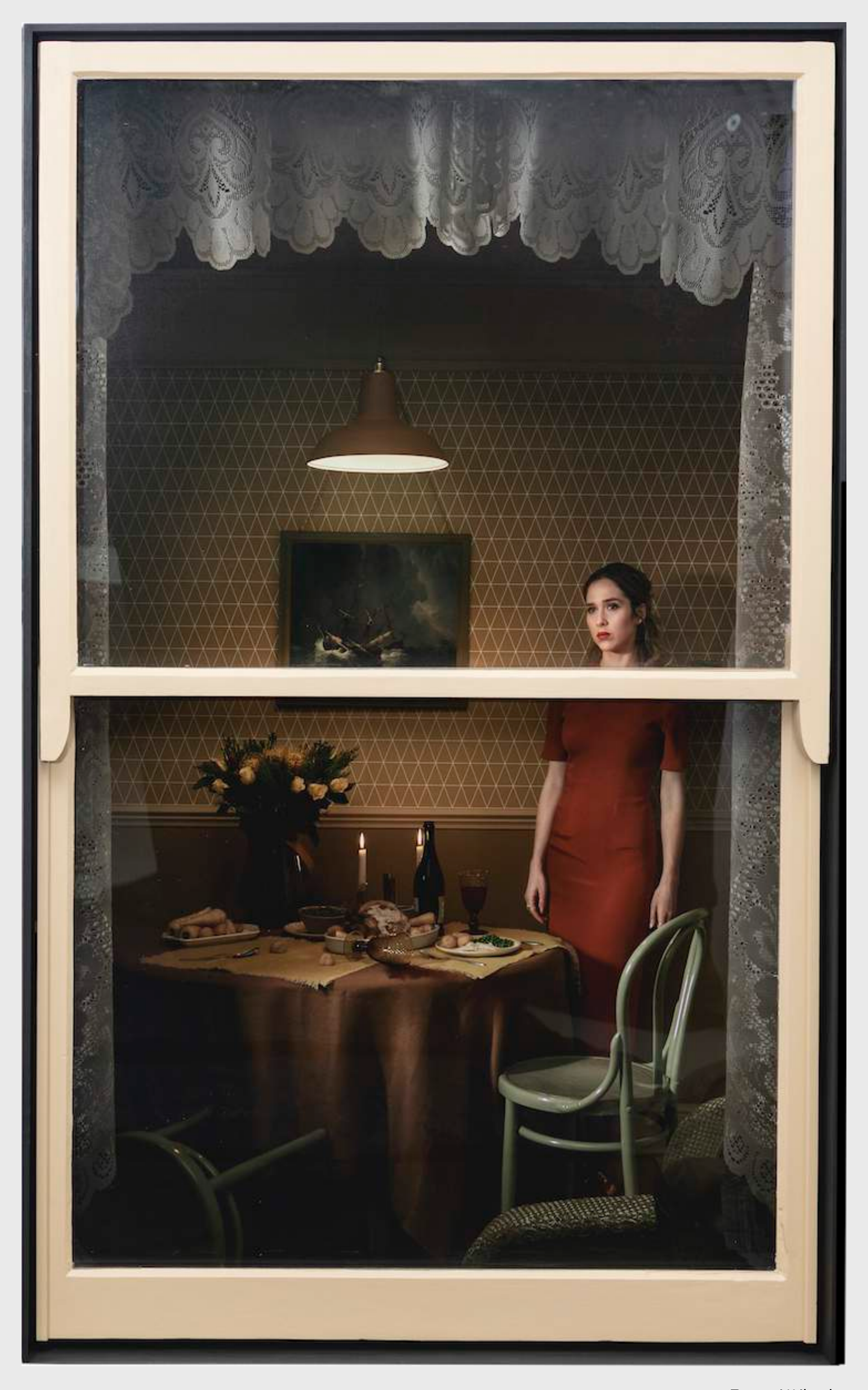
Rear Window (Dinner)