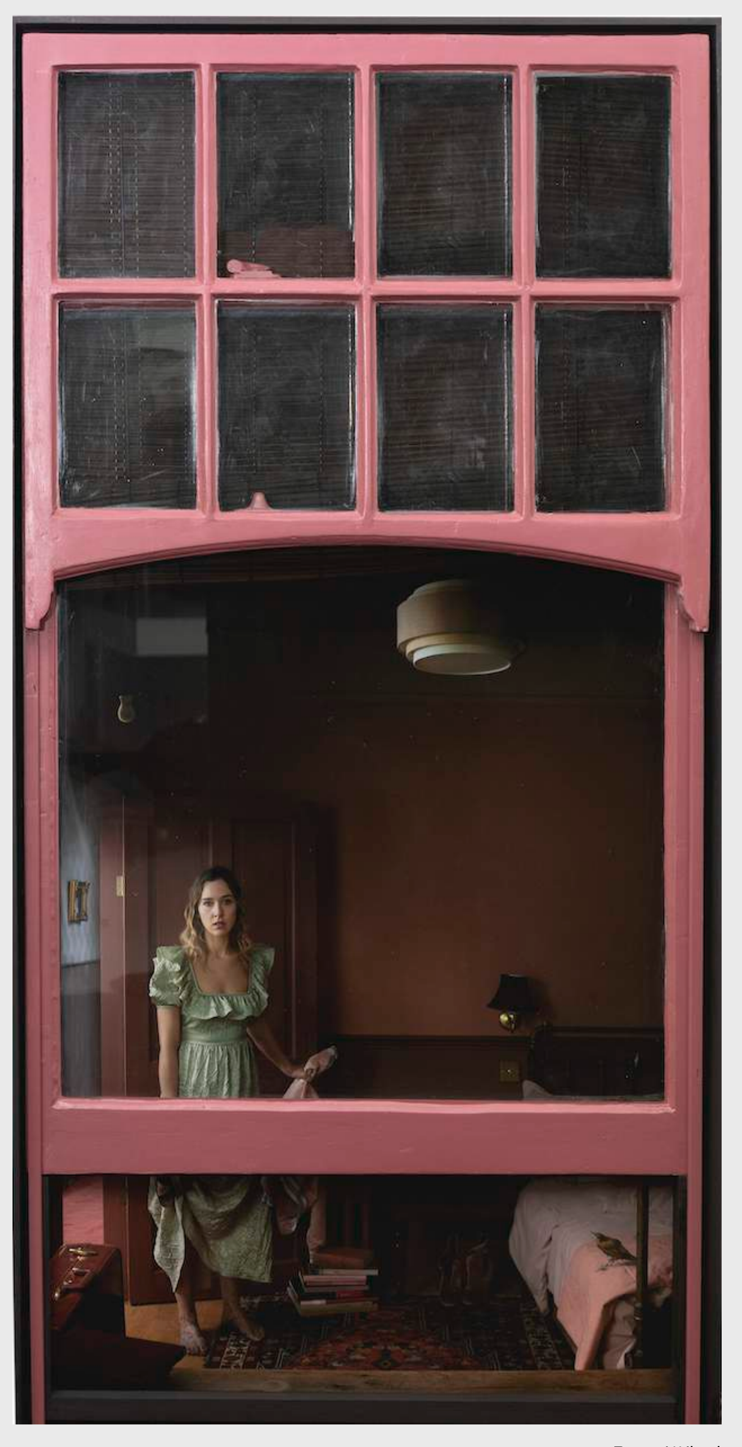
Rear Window (Bedroom with Bird)